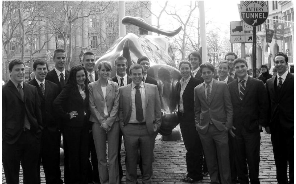
16 of the 17 students who toured Wall Street in January 2010.